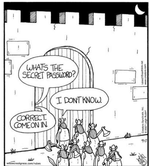
Why great care and consideration should be taken when selecting the proper password